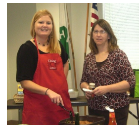
Ottawa County Extension staff learning more about the Dining with Diabetes program.